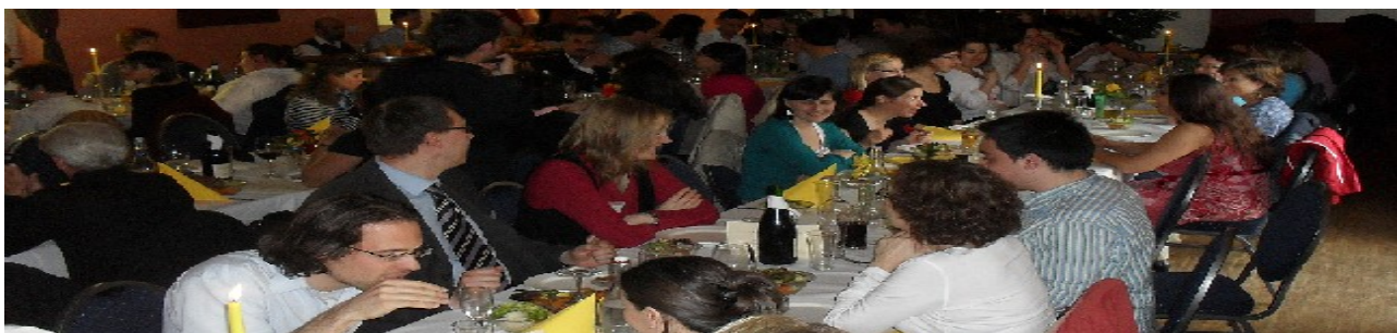
Terminology get-together: TSS2010 participants during the social event

A novelty this year was the launch of the ECQA Certified Terminology Manager. Participants of TSS, and anybody who registered with TermNet in advance, were offered the unique opportunity to be the first to be certified for a very special rate. Despite all challenges and difficulties a launch of this kind brings along it was an enormous success. Since its launch more than 50 certificates were issued and we receive frequent requests from all over the world. More information: termnet@termnet.org .